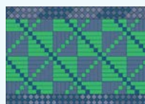
Te Kete Hāpai Akoako Kete of Professional Learning and Development