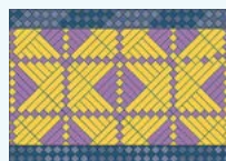
Te Kete Rauemi Mātauranga Kete of Māori Resources

Since June 2022, our Pātaka or storehouse has been making it easier for visitors to our website to find content relating to Mātauranga Māori, Kaupapa Māori, success for Māori learners and building cultural capability. Visit ako.ac.nz/te-pataka-matauranga-maori and explore the Pātaka's four kete: