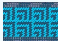
Te Kete Āheitanga Ahurea Māori Kete of Cultural Capability Pathways