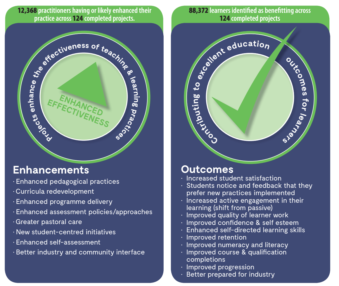
FIGURE 6: Impacts from projects involved in our IEF process

Appendix 2 highlights a selection of projects demonstrating the linkage between enhanced teaching and learning practice leading to enhanced student outcomes.